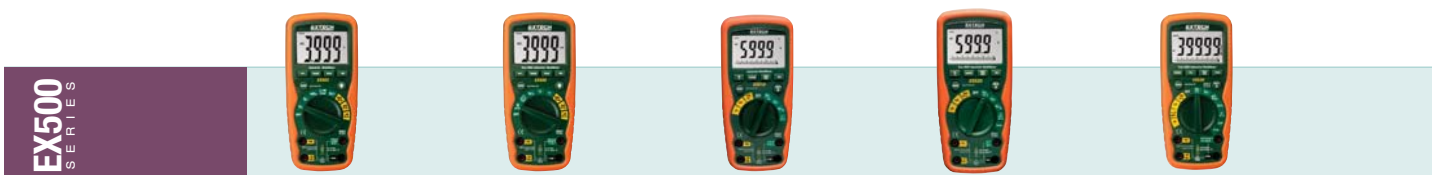
Drop-proof to 6 feet (2.9m)